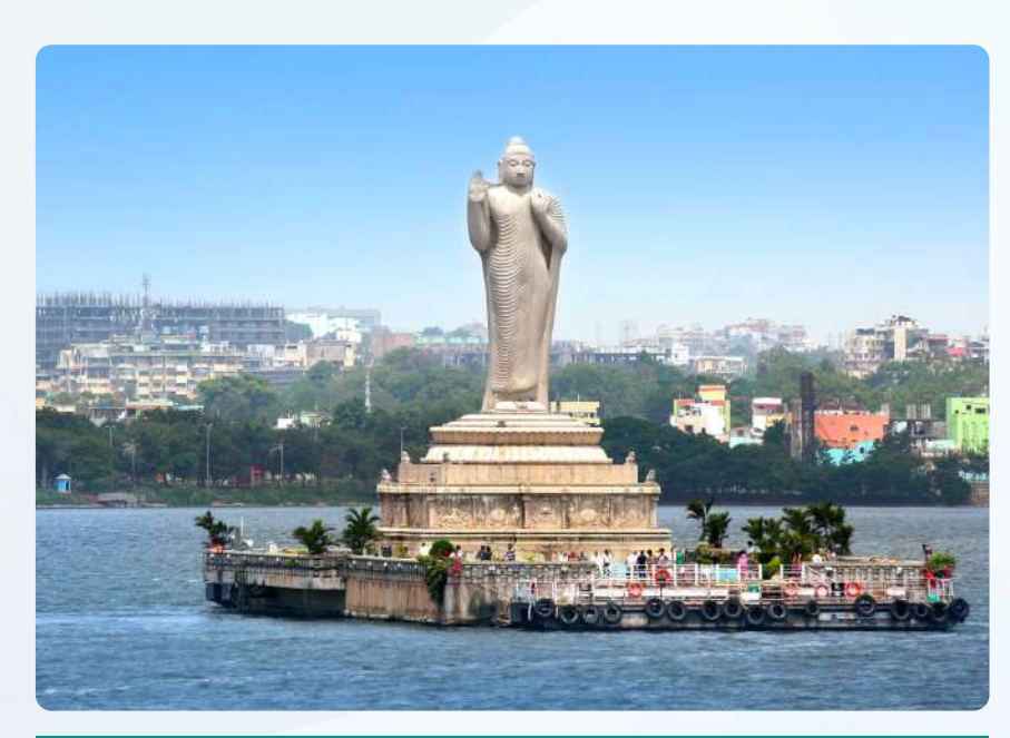
Hussain Sagar Lake

This majestic fortification is a testament to Hyderabad's medieval grandeur. Perched on a hill, it provides panoramic views of the city and hosts a captivating sound and light show in the evenings.