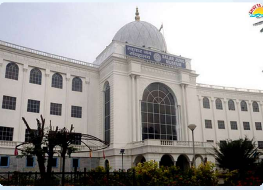
Salar Jung Museum

Holding the title of the world's largest film studio complex, this wonderland offers entertainment for all ages. From enchanting film sets to thrilling rides and shows, it's a must-visit for movie buffs and families alike.