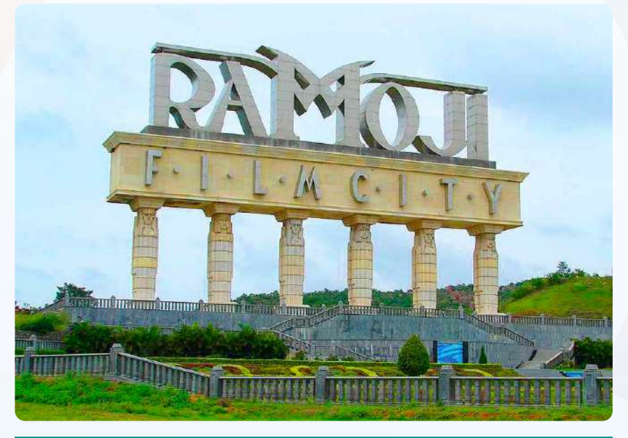
Ramoji Film City

The iconic four-towered structure stands at the heart of Hyderabad, symbolizing the city's rich heritage and vibrant culture. A visit here offers a glimpse into the bustling bazaar life and intricate Islamic architecture.